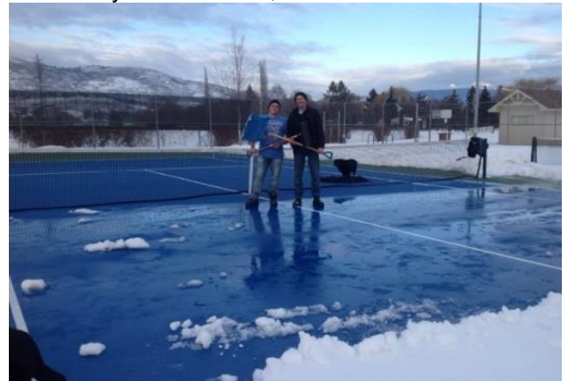
Guys with shovels, that’s how it’s done!